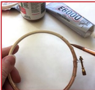
Unicorn SpIt color shown in Squirrel

Step 2: Stain the outer hoop completely with Unicorn SPiT (SPiT can be diluted with water). Set aside and allow to dry.