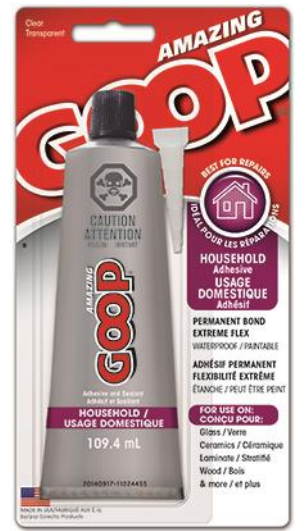
109.4 mL Not all styles/sizes available in all areas