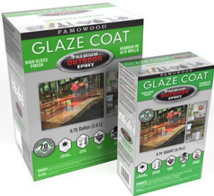
96 fl oz Kit & 24 fl oz Quart Kit