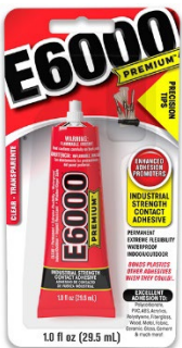
1.0 fl oz Precision Tip