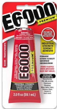
2.0 fl oz Flat Tip