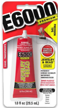
1.0 fl oz Jewelry & Bead