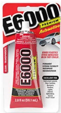
2.0 fl oz Automotive

storage after opening, cover or plug the opening of the nozzle (if a cartridge) .