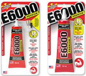
29.5 mL Prec Tip & 5.1 mL