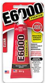
84.4 g Nozzle Tip