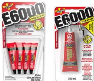
5.3 mL Mini PK/29.5 mL Jewelry & Bead