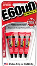
5.0 g mini tubes