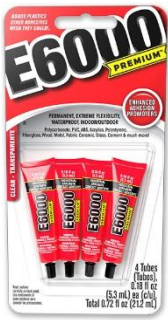
0.18 fl oz Minis