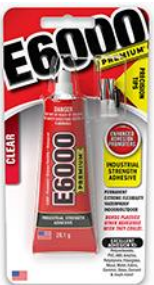
28.1 g Precision Tips