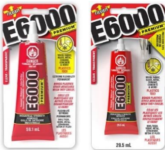
59.1 mL Nozzle Tip & 29.5 mL Prec Tip