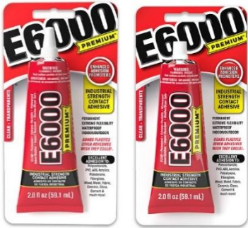
2.0 fl oz Nozzle Tip 2.0 fl oz Flat Tip