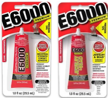
1.0 fl oz Precision Tip