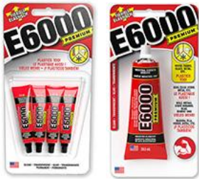
5.3 mL Mini Tubes & 29.5 mL